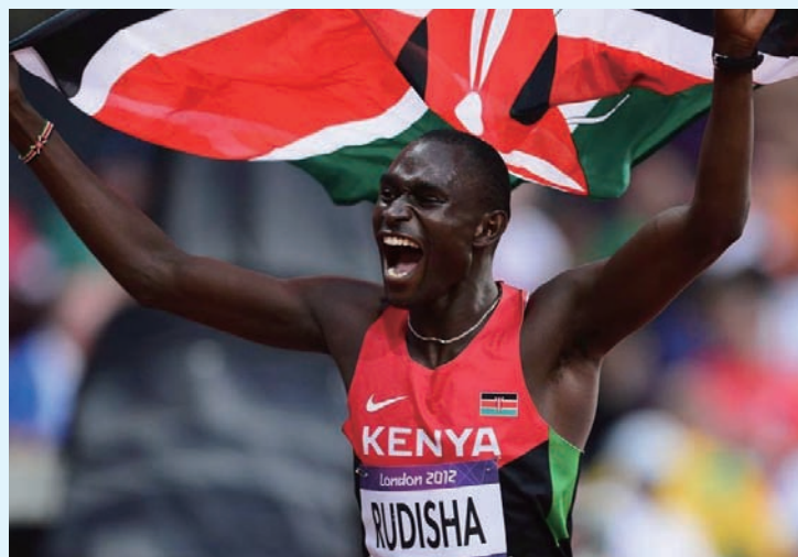
▲ Middle distance runner David Rudisha.

In all of these we celebrate the Olympic movement which I believe is a real challenge to us Methodists. I agree with Jacques Rogge, the President of the International Olympic Committee, who described London 2012 as 'Absolutely fabulous'. Sebastian Coe, Chair of London 2012, thanked competitors and volunteers and for their 'tenacity, ambition and imagination.' They are qualities I crave for our Church and that in the public arena we will be able to celebrate the transforming story of God in Christ. Now the baton comes to us as Methodists in Hong Kong. May God by his Spirit enable us to fulfill our high calling as servants of Christ and in our day. Amen. 🇬🇧