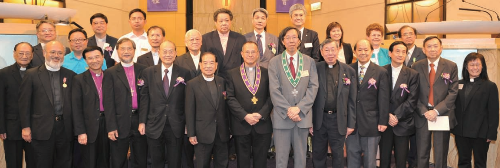
▲ President, Vice-President together with guests and officiating members after the Inaugural Ceremony of the President and the Vice-President