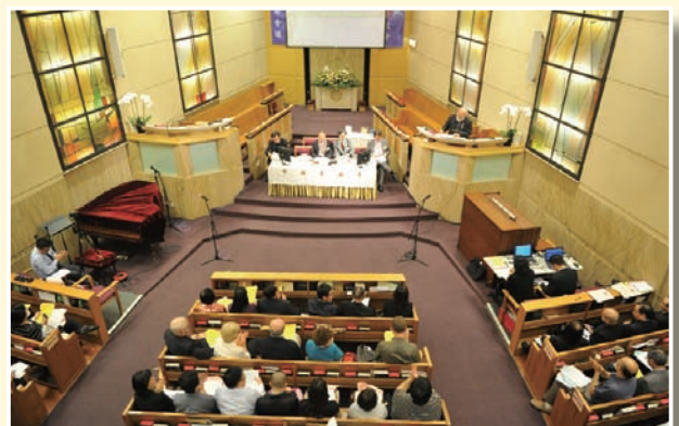
▲ Over 370 delegates and observers attending the Representative Session and Inaugural Ceremony of the President and the Vice-President held in the Chinese Methodist Church, Wan Chai, Hong Kong