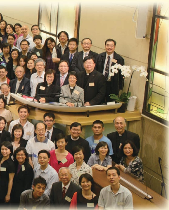
▲ Group photo of all participants

The suggestions of the Pre-primary Education Development Concern Sub-Committee were accepted so as to have standardized practices in our kindergartens and day nurseries: “To set the retirement age of the head-teachers and teachers at 60. Any staff member who wished to continue service after attaining the age of 60 should submit an application to the School Management Committee which should decide after considering his/her appraisal report and health conditions. A successful applicant would be granted an extension of not more than 1 year each time until reaching the age of 65.” and “To adopt the Master Pay Scales provided by the Civil Service Bureau (CSB) as from the 2012-13 school year.