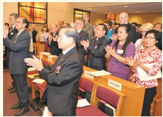
▲ Big applause to the new President and the new Vice-President

Kwun Tong Methodist Church to develop her city mission with the fund raising target being set at HK$40 million ($20 million to be borne by members of the Kwun Tong Methodist Church and $20 million to be raised at the Conference level from members of other Methodist Local Churches and subsidiaries) were accepted, the Kick-Off Ceremony for the Fund Raising Campaign for Purchasing New Church Premises for Kwun Tong Methodist Church was held. Representatives from different Local Churches received the relevant information of the Campaign, signifying their full support and participation. Over 200 brothers and sisters from the Kwun Tong Methodist Church came to witness this historic moment.